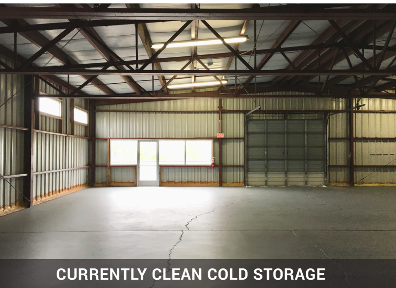
CURRENTLY CLEAN COLD STORAGE