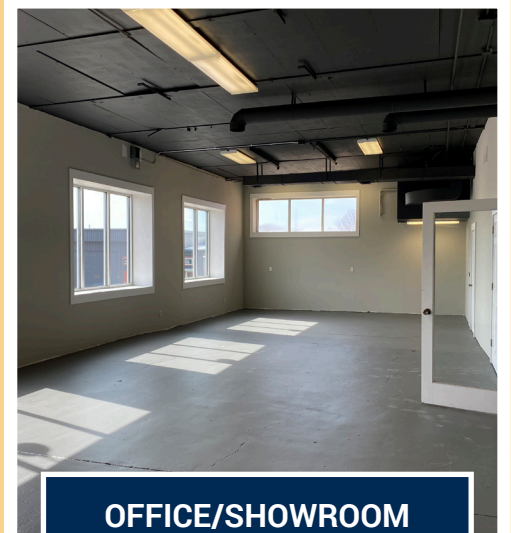
OFFICE/SHOWROOM 1 ST LEVEL

Office & Showroom Space Warehouse Space Outdoor Storage Dock & Drive-In Doors Heavy Three Phase Power Finishes to Suit Tenant