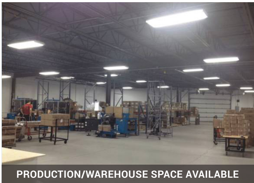
PRODUCTION/WAREHOUSE SPACE AVAILABLE