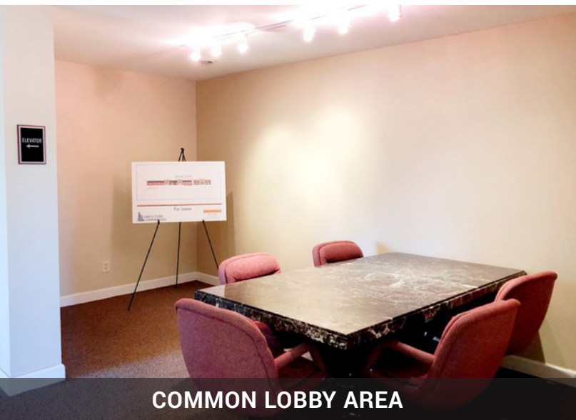
COMMON LOBBY AREA