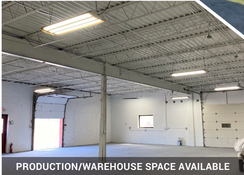
PRODUCTION/WAREHOUSE SPACE AVAILABLE