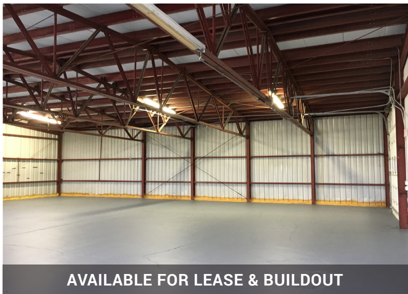
AVAILABLE FOR LEASE & BUILDOUT