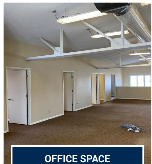
OFFICE SPACE 2 ND LEVEL

Baldwin East is a 12-½ acre Commercial and Light Industrial Park located just a short distance from I-94 in Baldwin, Wisconsin. The property consists of the former Dairyland Power Building, which is 40,000 SF, along with a 60,000 SF multi-tenant office/warehouse building.