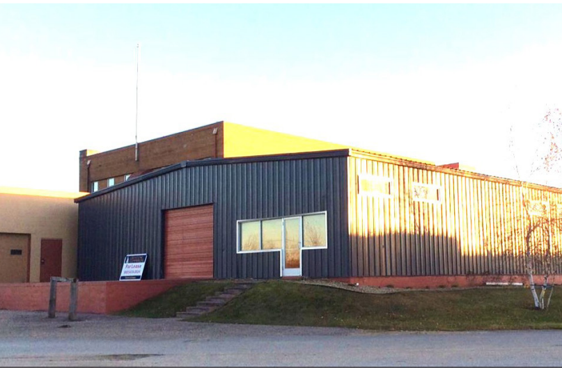
EXTERIOR FACADE REMODEL COMING