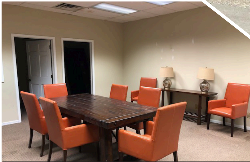
CONTIGUOUS SPACE AVAILABLE