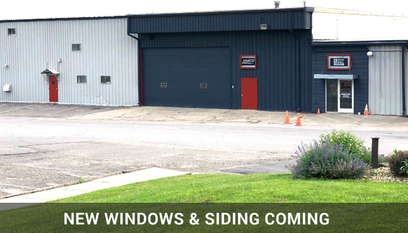
NEW WINDOWS & SIDING COMING