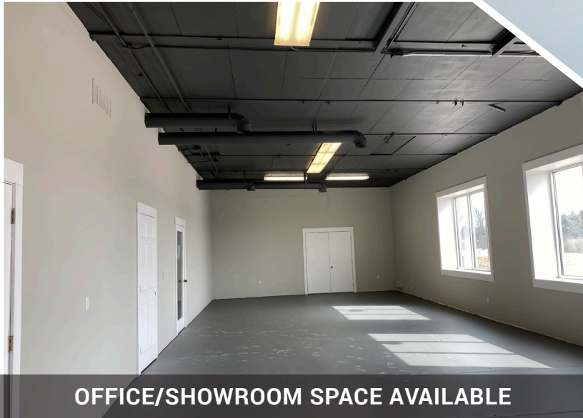
OFFICE/SHOWROOM SPACE AVAILABLE